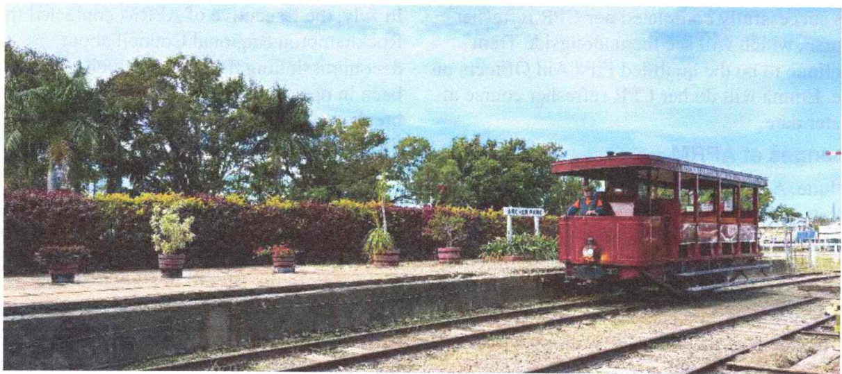
Above: The Purrey Steam Tram in operation on the day of the Rockhampton Show Holiday (Thursday 12 June 2025).