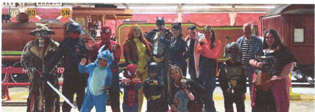
Above: The Heroes v Villains at the Family Fun Day on Sunday 29 June 2025.