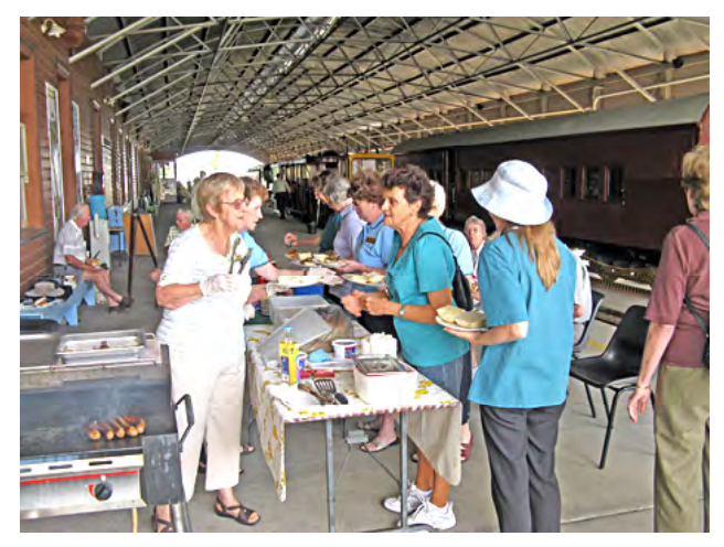
Lining up for a 'snag' under the Carriage Shade for a Carriage Shade Capers Sunday in 2010 [lz 6641]

The carriage shade is the full length curved roof over the platform and adjacent tracks. It protects passengers and trains from the tropical sun and eliminated the need to build a separate carriage shed. The opening at the top allows heat and locomotive/tram smoke to escape.