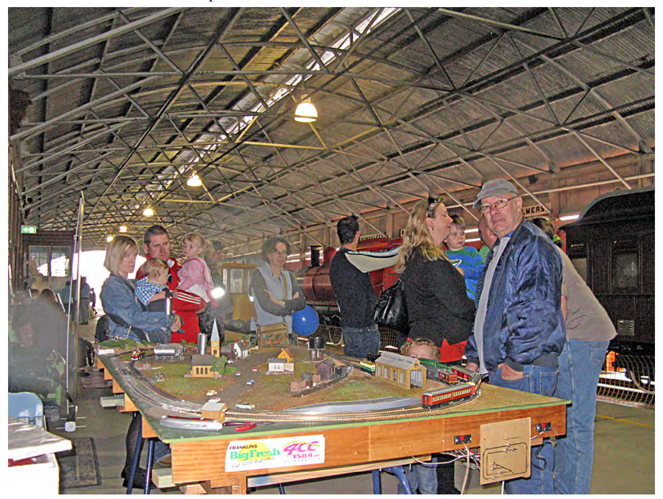
Under the Carriage Shade: Family fun and model railways during the June 2012 'Capers'. [lz 9631]