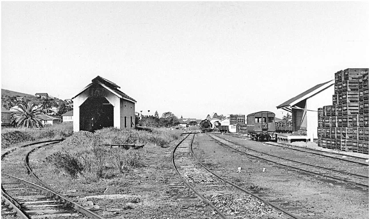
Yeppoon Station Yard looking towards the station and carriage shade, 18 April 1965.