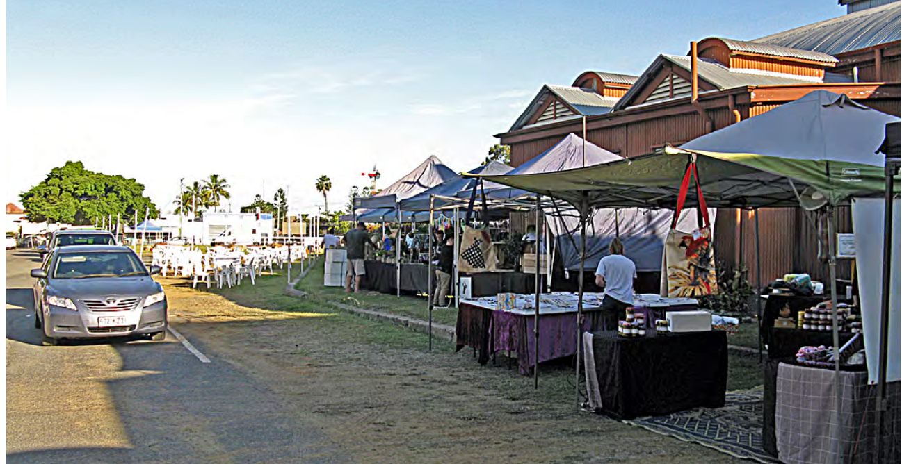
Above and below: Setting up for Eats Street just before sunset, 24 June 2017.