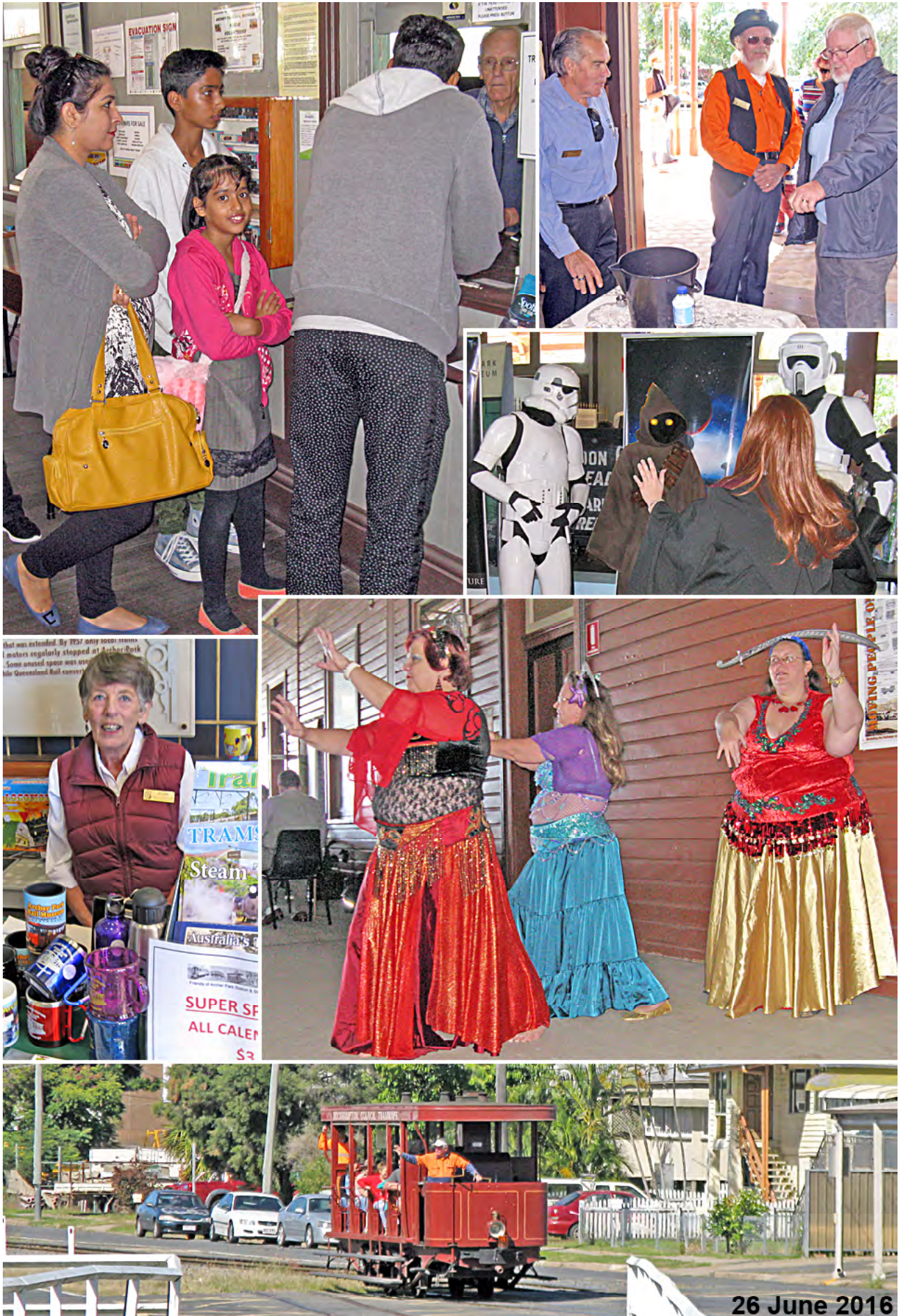
Sunday Capers, 26 June 2016