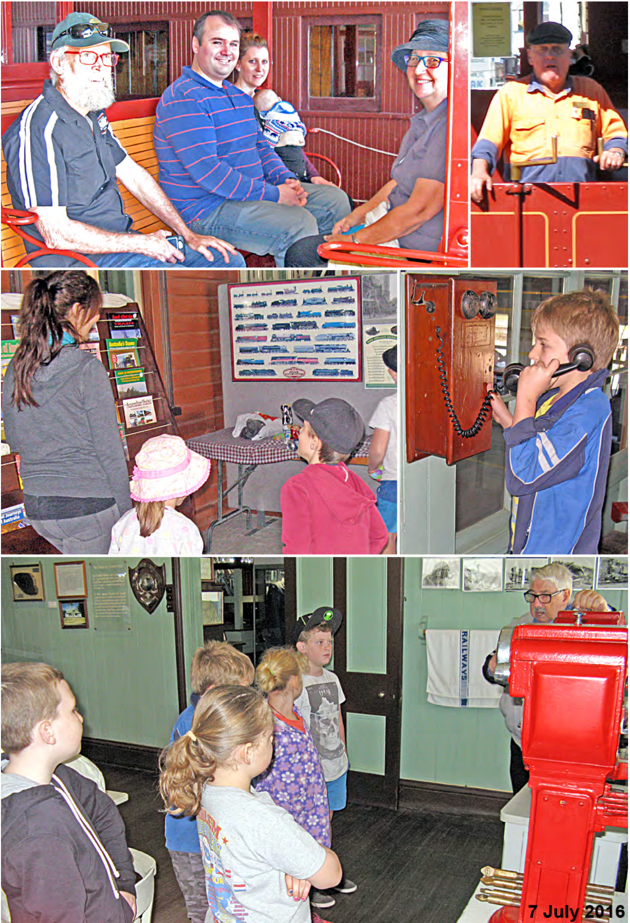
Wednesday, 7 July – School Holiday Activities with over 80 participants on the day.