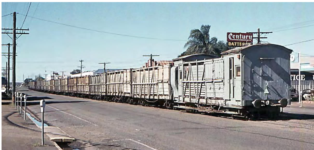
Stock train in Denison Street, with a KKB van with drovers guard compartments, Rockhampton, 17 August 1975