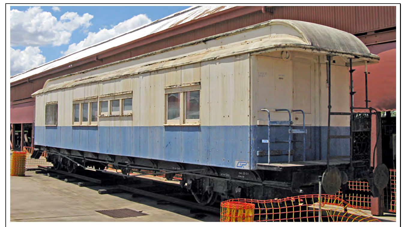
Newly arrived, QR CWM21 (Camp Wagon Mechanical Department) awaits cosmetic restoration and installation of additional museum displays, 10 November 2015.