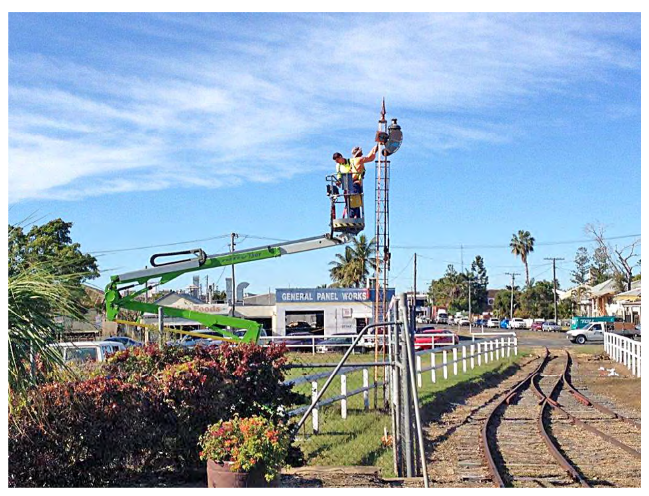
Signal arm being fixed following Cyclone Marcia damage.