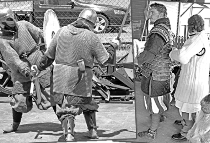
Above and below: Images from the Family Fun Day, 27 October 2013.