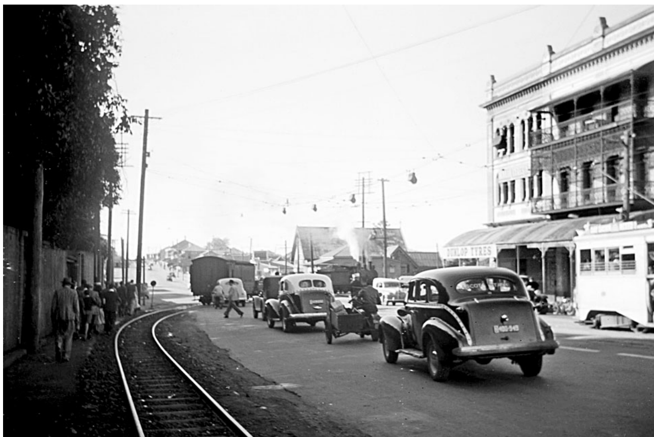
Rockhampton wasn't the only place where railway tracks ran along city streets — Crossing Stanley Street in Woolloongabba, June 1950.

Click on Image Collection and use Garth Fraser as a search term at http://QldRailHeritage.com .