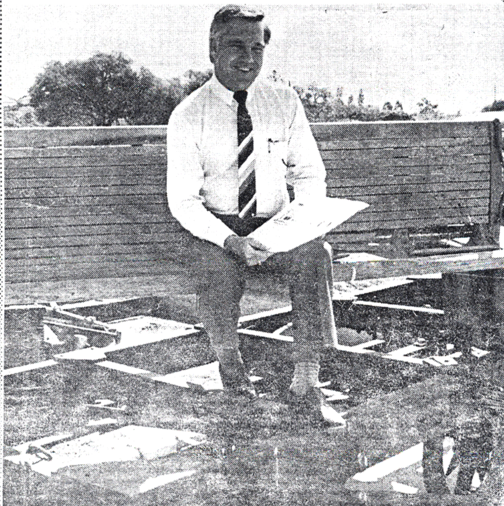
● Rockhampton Mayor Ald Webber sits on part of an old Purrey steam tram. The restoration of the tram to working order and its return to the city's public transport system are a bicentennial project

Ald Webber said the tram would be incorporated in the city's public transport system.