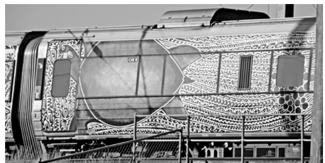
Cairns Tilt Train, Bundaberg, September 2011, Graham Hibberd photographer.

Graham Hibberd of the Bundaberg Rail Museum (North Bundaberg) recently spotted the newly painted Cairns Tilt Train with its subdued aboriginal style designs. Colour versions of these and other photographs of the new paint scheme can be found in the Rail Heritage Image Collection accessible from the web site.