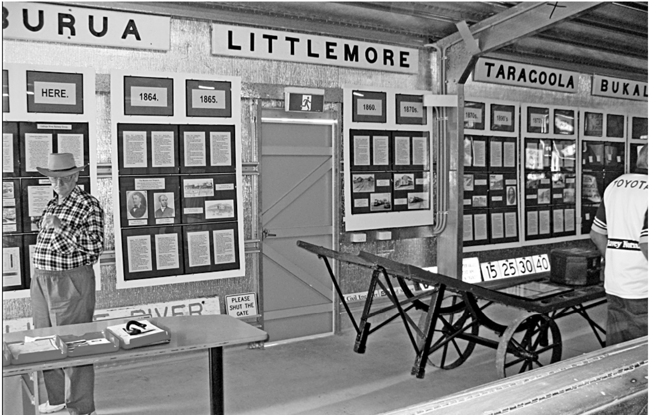
The almost completed history wall at the Calliope River Historical Village's rail museum. The CQ regional rail heritage group visited here late August and saw the newly developed exhibits following the museum's move from Gladstone.