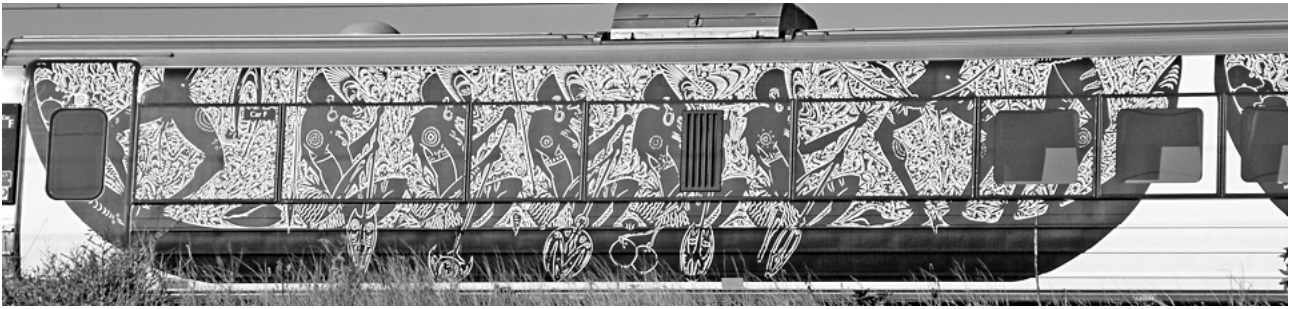
Cairns Tilt Train, Bundaberg, September 2011, Graham Hibberd photographer.