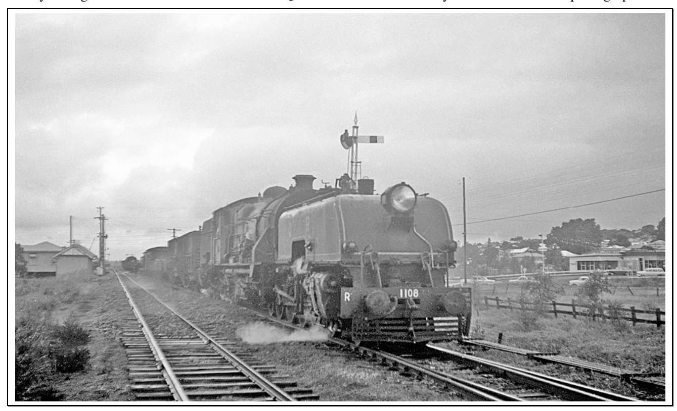
Rockhampton 1963 : QR's Beyer-Garratt 1108 approaching Port Curtis junction on its way west.