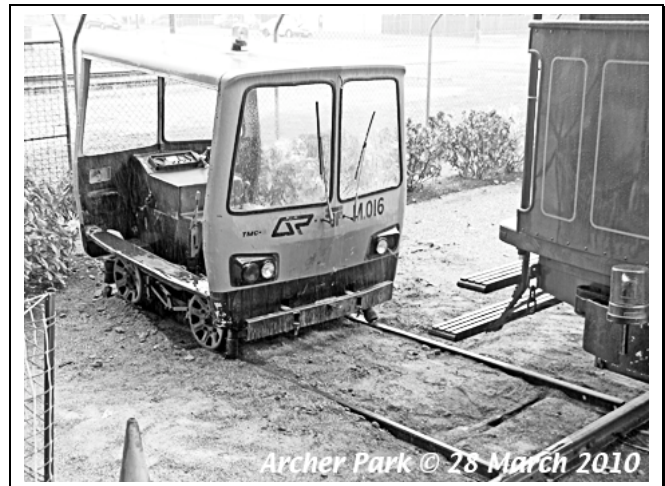
Rail car QR M016 at the end of the station platform during heavy rain, 28 March 2010.

print their own copies from the website [ QldRailHeritage.com/archerpark ].