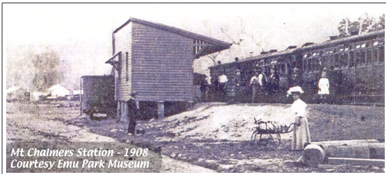
The Mt Chalmers station in 1908.

I would like all volunteers when they receive their new Blue Cards to bring them in and show me as they have to be put into the computer to be on record, this is the law. As the law states, anyone who doesn't have a blue card ,or who hasn't applied for a renewal, may be asked to leave where they are working.