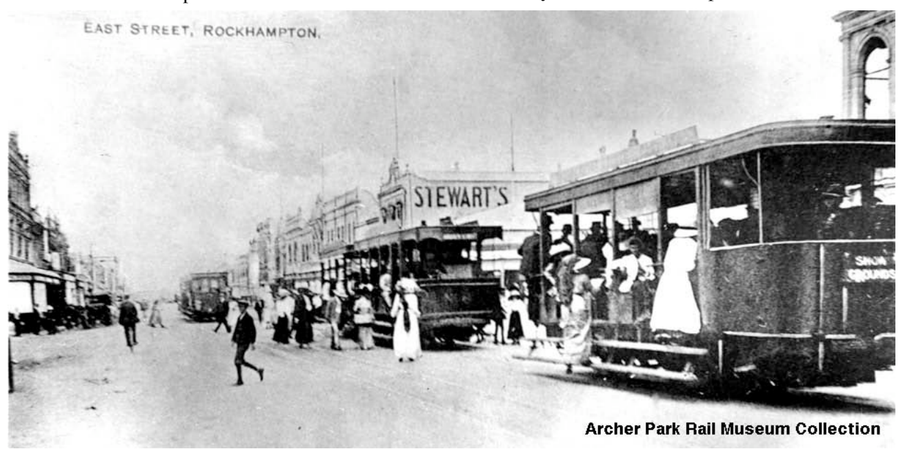
Rockhampton's Purrey Trams operating along East Street, date unknown but early years.

Archer Park Rail Museum, Atherton Tableland Railway, Aust. Narrow Gauge Railway Museum Society, Aust. Railway Historical Society - Qld, Australian Sugar Cane Railway, Bally Hooley Steam Railway, Brisbane Tramway Museum, Bundaberg Railway Historical Society, Darling Downs Historical Rail Society, Mackay Heritage Railway, Mary Valley Heritage Railway, Queensland Pioneer Steam Railway, Qld Rail, Ravenshoe Railway Company, Savannahlander, Southern Downs Steam Railway, Sunsteam, Workshops Rail Museum - Qld, Timbeerwah Mountain Railway, Trainaway Tours, Whistle Stop.