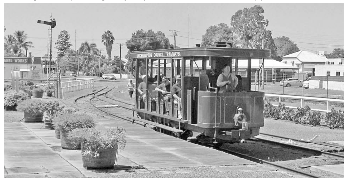
ATRQ members from around Queensland enjoyed a ride on Archer Park's Purrey Tram, during the Sunday operating session, 01/03/09.