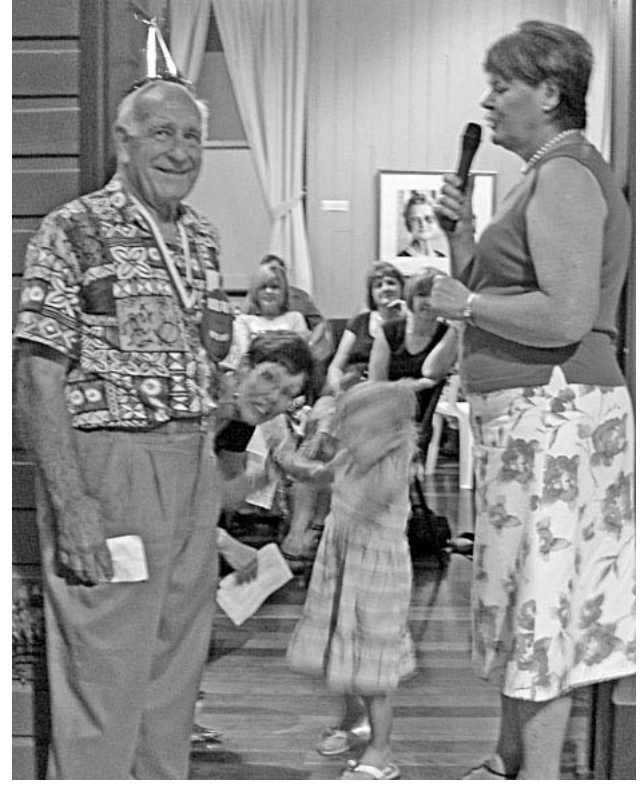
Congratulations from colleagues and friends...