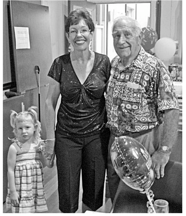
A family celebration...