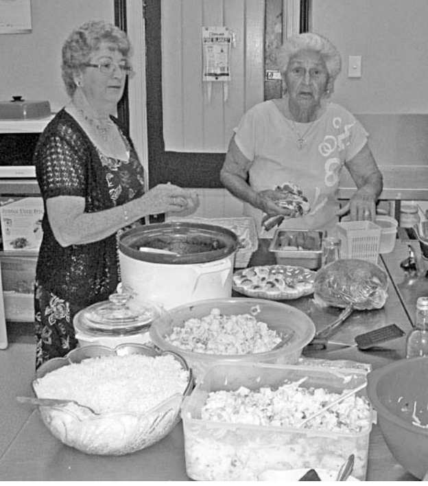
Colour versions of these and other party photos are on the web site: QldRailHeritage.com/ArcherPark.