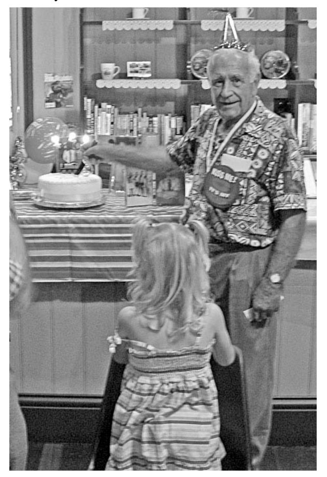
Cutting the cake...