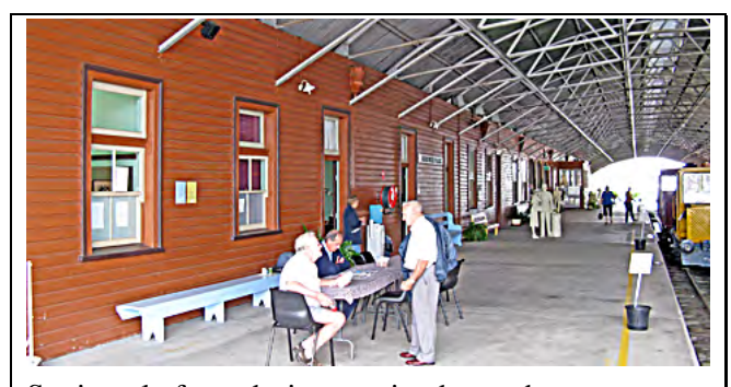
Station platform during a quiet day at the museum.

Unlike most Australian railway stations, Archer Park was built as the primary passenger station and, aside from the 1907 refreshment room addition, remained much as it was built. The reduction in passenger traffic after 1923 meant that it avoided the modernisation that many stations underwent and the post-1970 changes for freight use retained the basic fabric of the building.