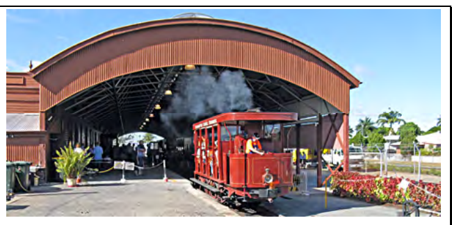
Purrey steam tram emerging into the sunlight from Archer Park's arched roof shed. QR's main North Coast line runs to the right as it did 100 years ago.

The station was added to Queensland's Heritage Register 21 October 1992, underwent four years of restoration begun in 1996, and opened as a volunteer operated museum 11 December 1999.